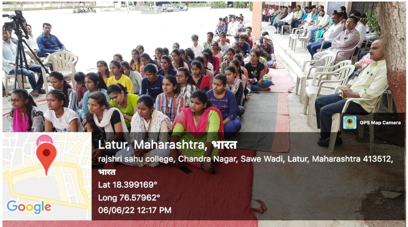
Student, Teaching and nonteaching staff participated in the shivrjabhishek shohla