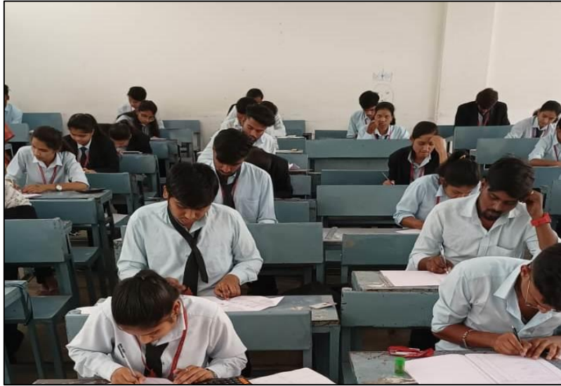
Students attempting Examination