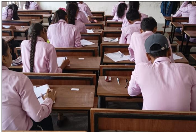
Students attempting Examination