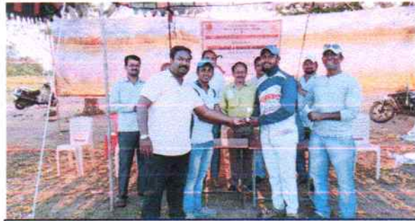
Best Heater of Base Ball & Soft Ball