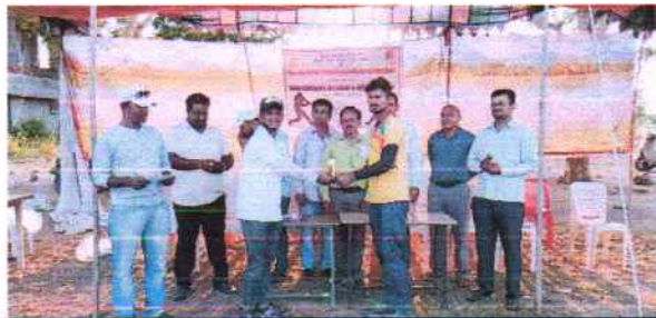
Best Pitchers of Base Ball & Soft Ball