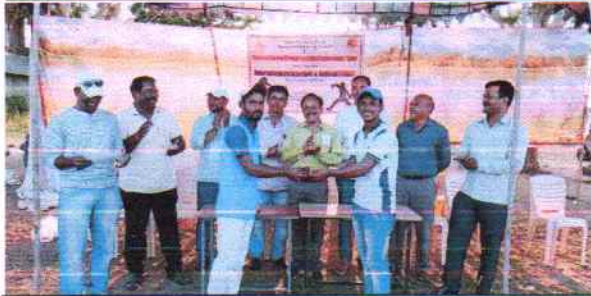
Best Catcher of Base Ball & Soft Ball