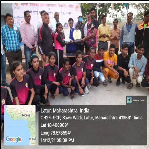
General Championship Jaikranti College, Latur