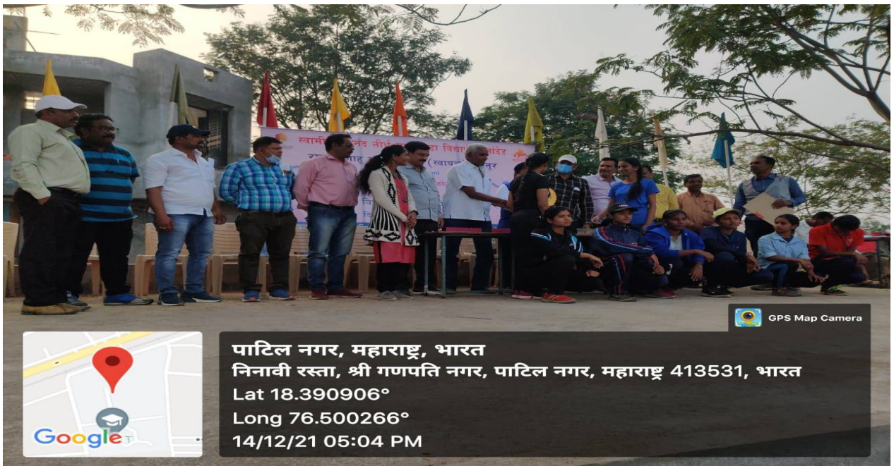
Championship Among the Girls R. S College, Latur