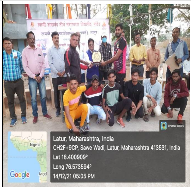
Championship Among the Boys Jaikranti College, Latur