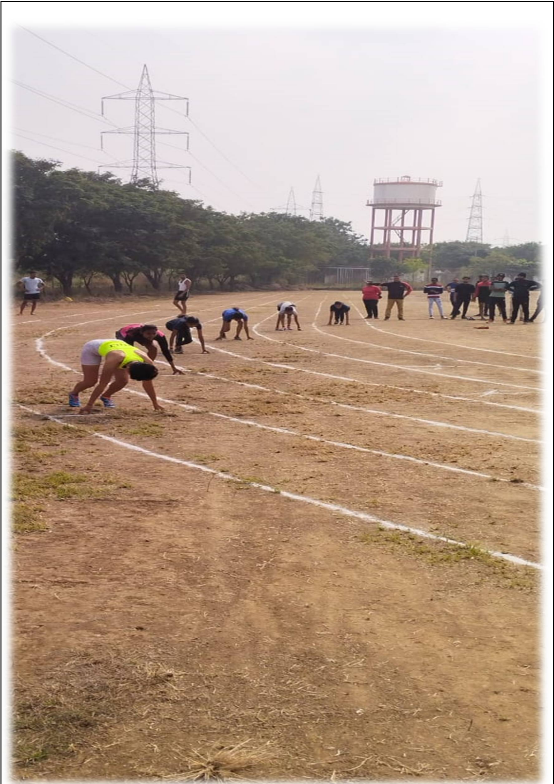
Inter Collegiate 'A' Zone Athletic Meet 2021-22