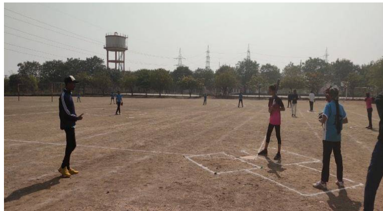
Playing on Ground