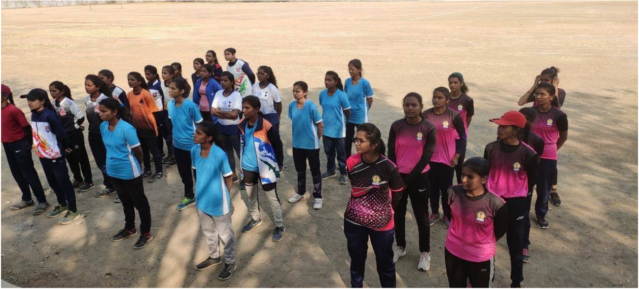
Inaugural of the tournament