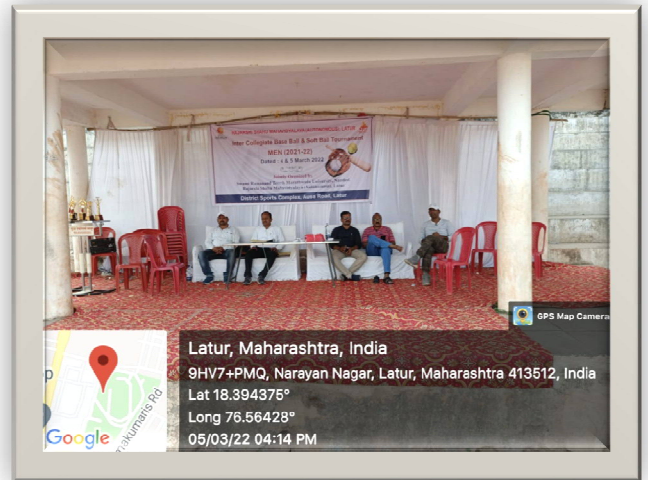
Selection Committee Members of the Soft Ball and Baseball Tournament