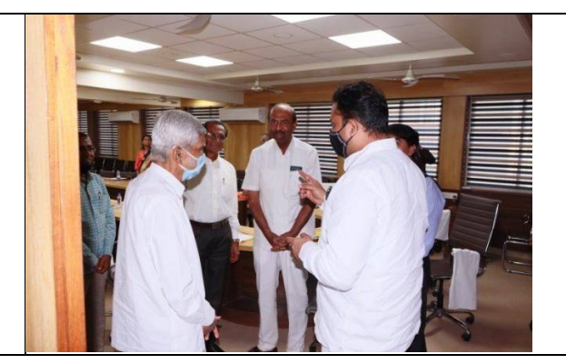
Press Conference of the tournament with the Mayor and Vice President of Latur District Soft ball Association.